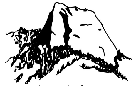
The Tooth of Time